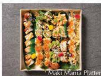
Maki Mania Platter