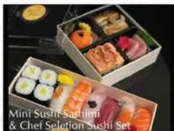
Mini Sushi Sashimi & Chef Selection Sushi Set