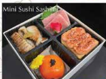
Mini Sushi Sashimi