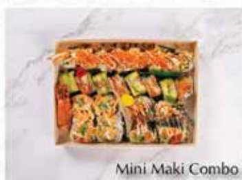
Mini Maki Combo