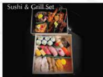
Sushi & Grill Set