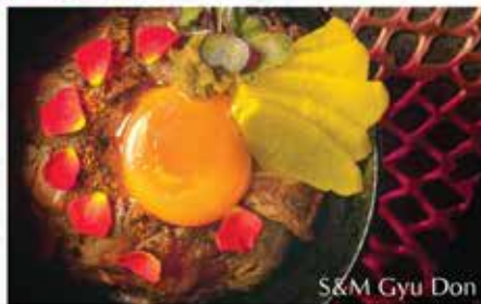
S&M Gyu Don