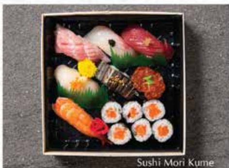
Sushi Mori Kume